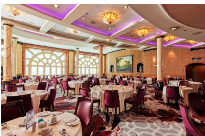
Dream Dining Room

總噸位 75,338 噸 載客 Guests 1,856 人 甲板 Decks 13 層