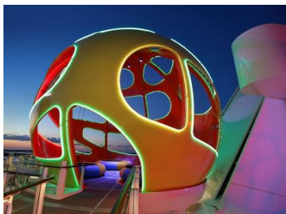
南極球 Skypad *新登場