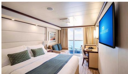
Deluxe Balcony Stateroom