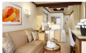
Mini-Suite 迷你套房 Size: ~320 sq. ft (Include balcony)