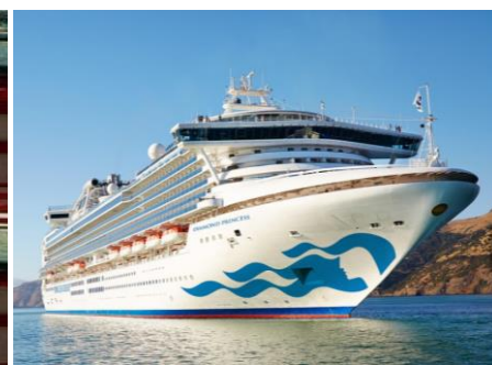
Diamond Princess 鑽石公主號