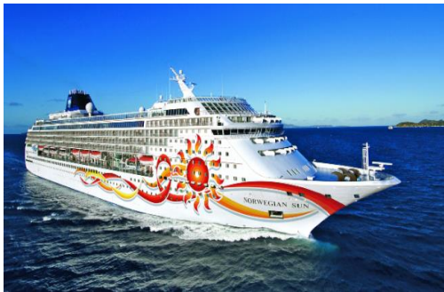
Norwegian Sun 挪威太陽號