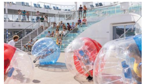
Piazza del Campo