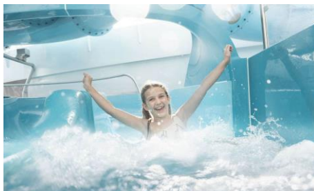
Splash Aqua Park

首航年份 2022 年 總噸位 182,700 噸 載客 Guests 6,218 人 船員 Crew 1,678 人 甲板 Decks 20 層