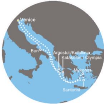
Costa Deliziosa 歌詩達盛饌號