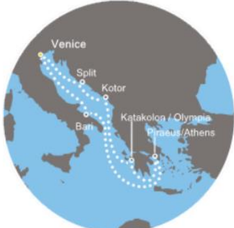
Costa Deliziosa 歌詩達盛饌號

GRT 總噸位- 92,600 | Refurbish 翻新 - 2018 | Pax 載客 - 2,828