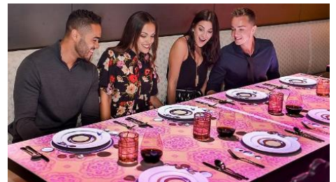
Le Petit Chef