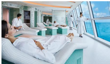
The Persian Garden