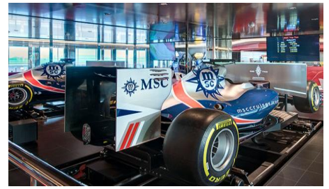
MSC Formula Racer