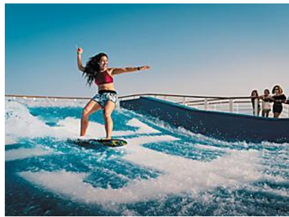
甲板衝浪® + 甲板跳傘