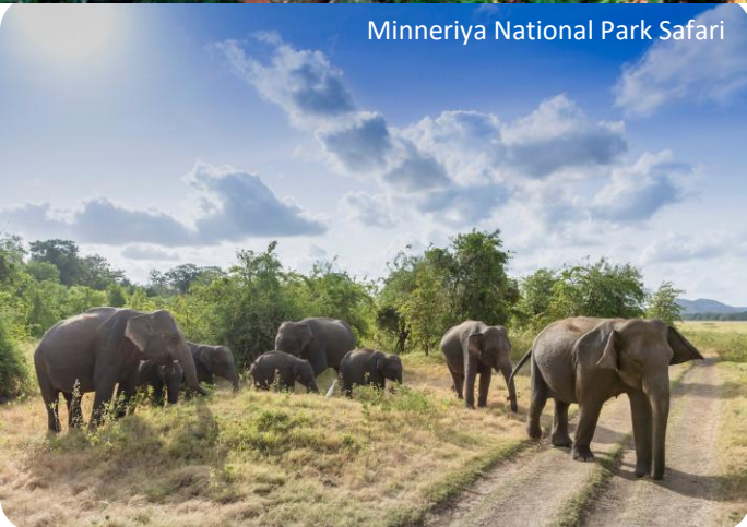
Minneriya National Park Safari