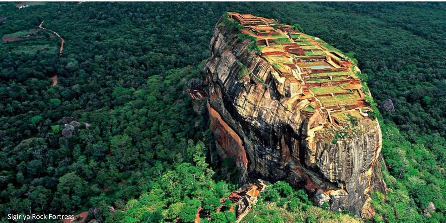
Sigiriya Rock Fortress

4夜 [出發日期：至2026年4月30日] | 4 Nights [Travel Period : Till 30Apr26]